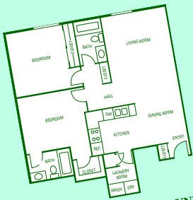
2 BEDROOM 2 BATH WITH LAUNDRY L KITCHEN 1035 SQ FT @ _____