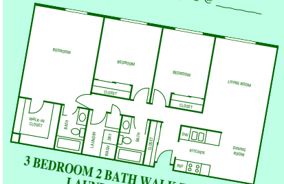
3 BEDROOM 2 BATH WALK THRU KITCHEN, LAUNDRY & MASTER SUITE 1340 SQ FT @ _____