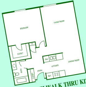
1 BEDROOM 1 BATH WALK THRU KITCHEN 723 SQ FT @ _____