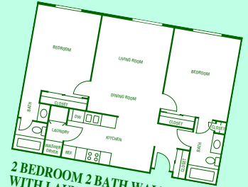
2 BEDROOM 2 BATH WALKIN KITCHEN WITH LAUNDRY 1045 SQ FT @ _____