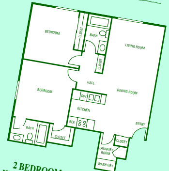
2 BEDROOM 2 BATH WITH LAUNDRY WALKIN KITCHEN 1035 SQ FT @ _____